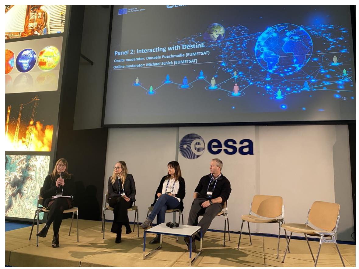
Figure 4 - Panel 2

Along the presentations of the three panellists, several questions were raised by the audience, online and in the room, about the Destination Earth System mechanisms and about technological capabilities.