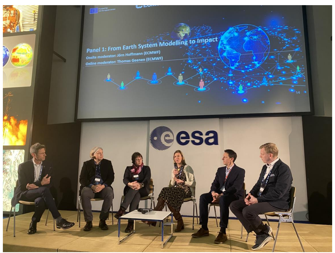
Figure 3 - Panel 1

5. Femke Vossepoel, Associate Professor at TU Delft, provided an overview of possible DestinE applications for a safe and sustainable delta development under a changing climate. It was pointed out that multiple Digital Twins, connected together, will most likely be necessary and gave an example of scenarios users might need to investigate to monitor salt intrusion into the Rhine delta showing how far saline water penetrated the delta, especially under drought conditions. The eWaterCycle was also presented as a flexible and interactive tool that could work well within the DestinE system. A partnership is currently being explored to link eWaterCycle to DestinE. A plethora of other relevant projects was presented stressing that interaction with users can reveal what type of Digital Twins will be needed in the future.