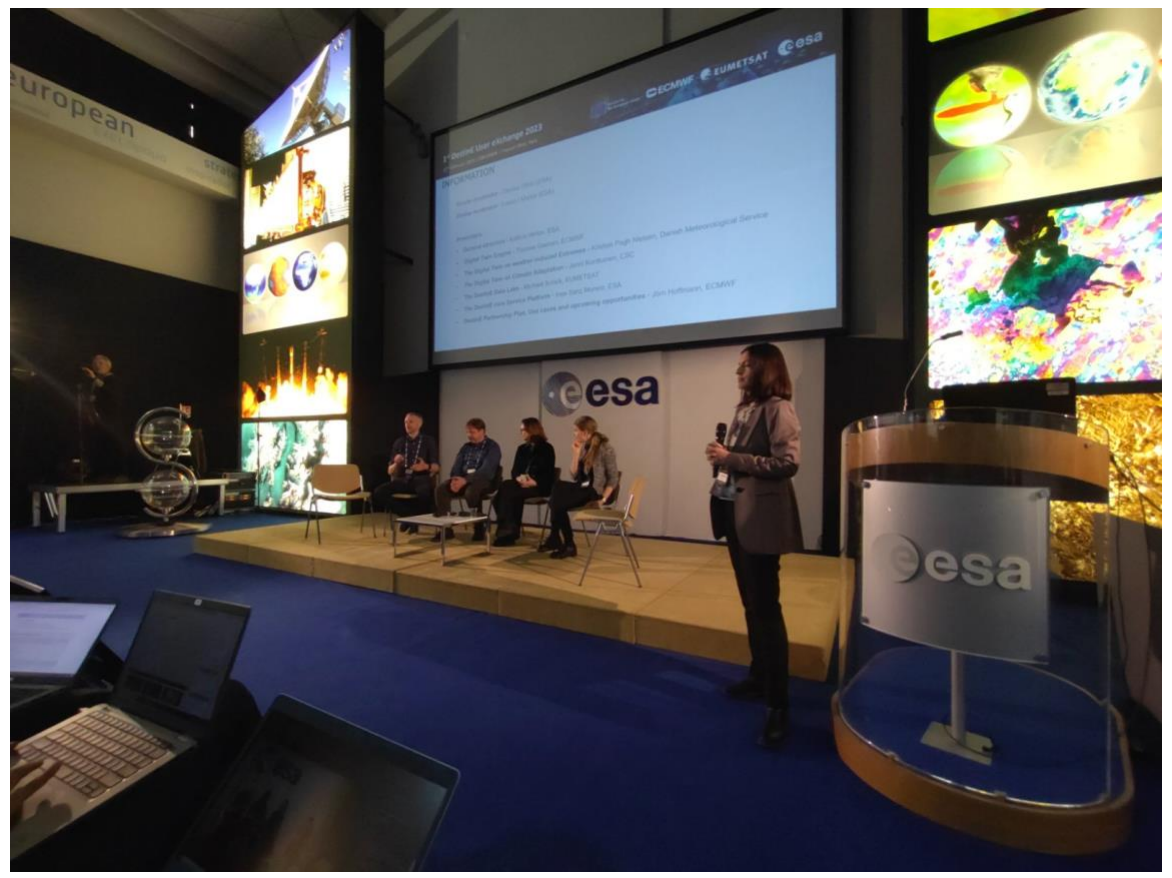
Figure 1 - Information session (part 1)

The audience enquired about key users for the Climate Digital Twin, to which Jenni Kontkanen replied mentioning national meteorological services with the possibility to expand to more users. The following discussion touched briefly on the existence of several interfaces and standards that could be potentially used within DestinE.