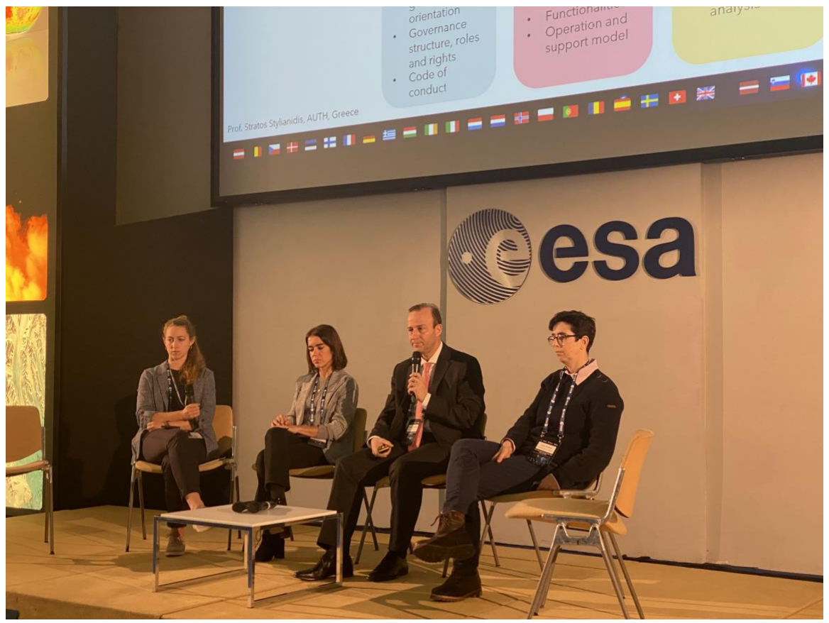
Figure 5 – Panel 3

(including users that have not yet been taken into consideration). The benefits of open science for open innovation include the possibility to encourage a wide range of collaborations to break silos, to generate products that will tend to be more interoperable and create greater impact. In this context, a bottom-up approach is important to encourage buy-in from DestinE Community members. Users should be given centre stage, because "Community is about people". The key to bridge the gap between science and policy making could lay in the "sharing while doing" approach. What do we need to support DestinE end-users? A platform to share and collaborate, a Code of Conduct to create a positive atmosphere that encourages contributions, to be as inclusive as possible.